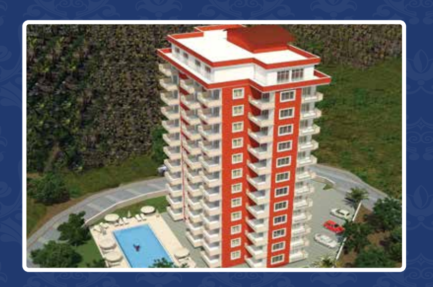
Euro Residence XVI