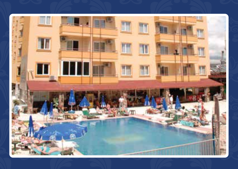
Hacibey App. Hotel