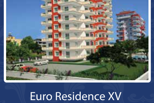
Lara Beach Park