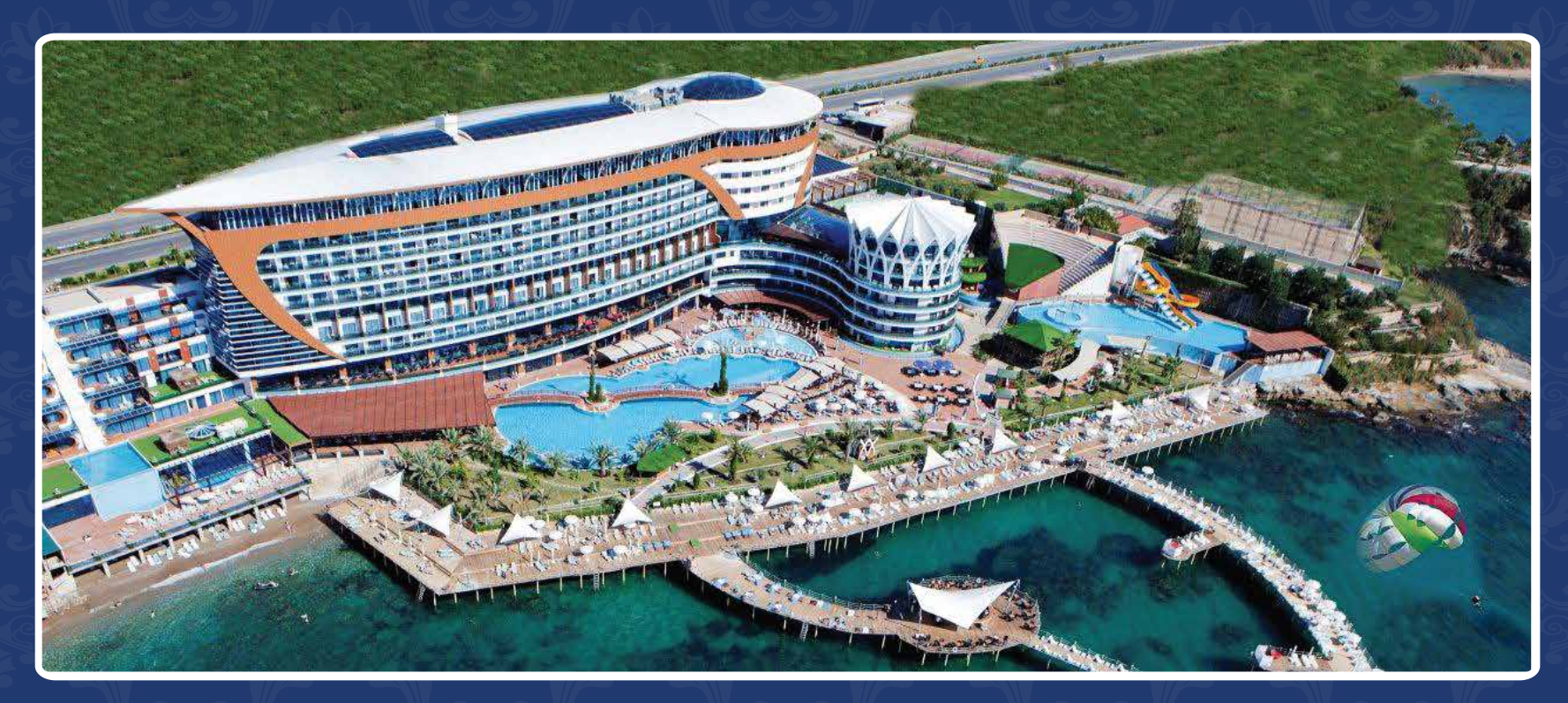
Granada Luxury Resort & Spa