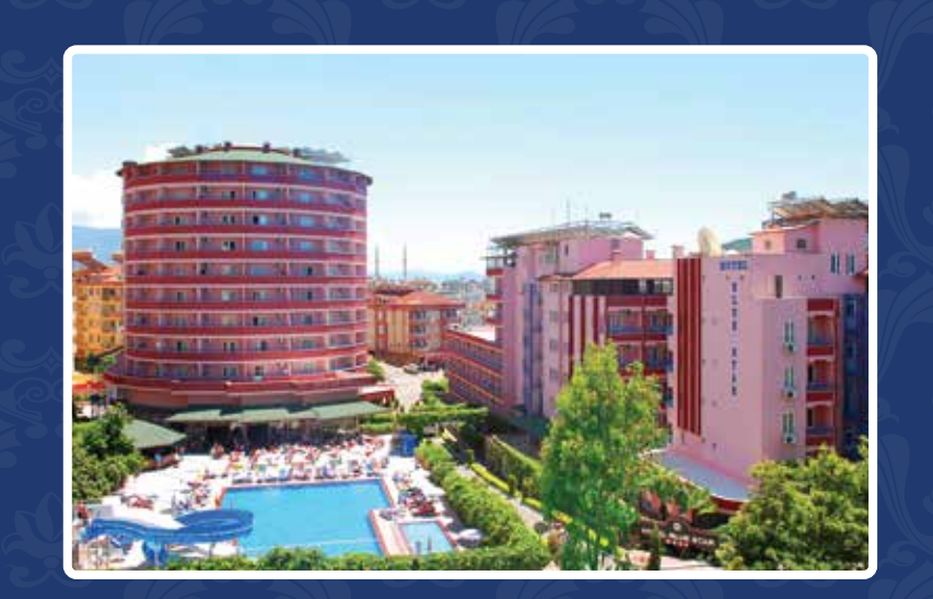
Blue Star Hotel